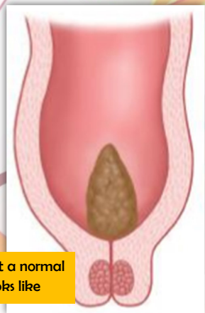
This is what a normal bottom looks like

This picture shows you what it looks like inside your tummy when you have constipation. Look at all that stuck poo!